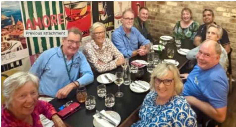
After training supper Feb 2026