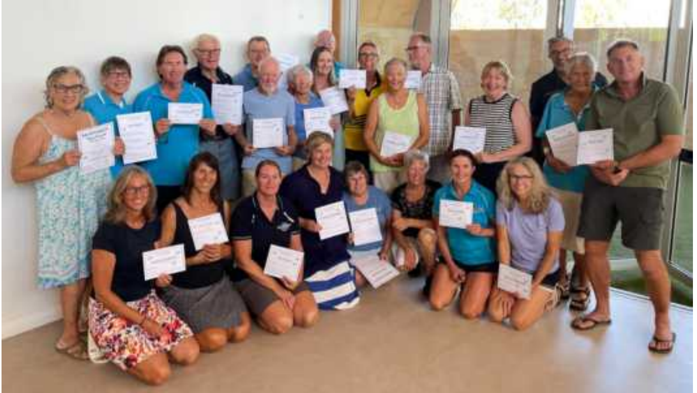
Swimmers with their Top Ten Certificates for 2024 ^

The AGM had a good attendance and was preceded by a Club Swim in preparation for the Newman Churchlands ABC CC.